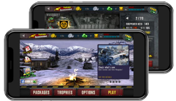
Players engage with ads to earn rewards

■ Feelingtouch is committed to producing high quality and innovative mobile games. Known for such popular titles as Zombie Frontier and Zombie World War, they have achieved more than 300 million downloads across their portfolio since 2010. By constantly attracting new players, as well as having a loyal following of existing gamers, they have consistently ranked as one of the top developers of mobile games in the world.